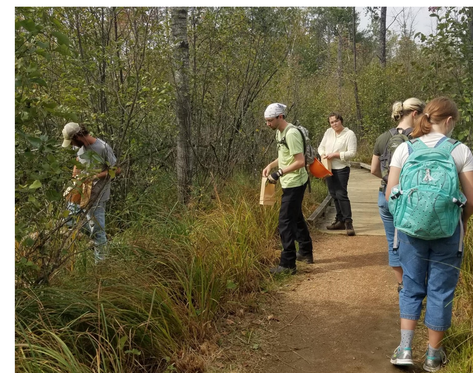
Fig 2. Stewards collecting seeds from sedges to plant on the Pine Prairie site