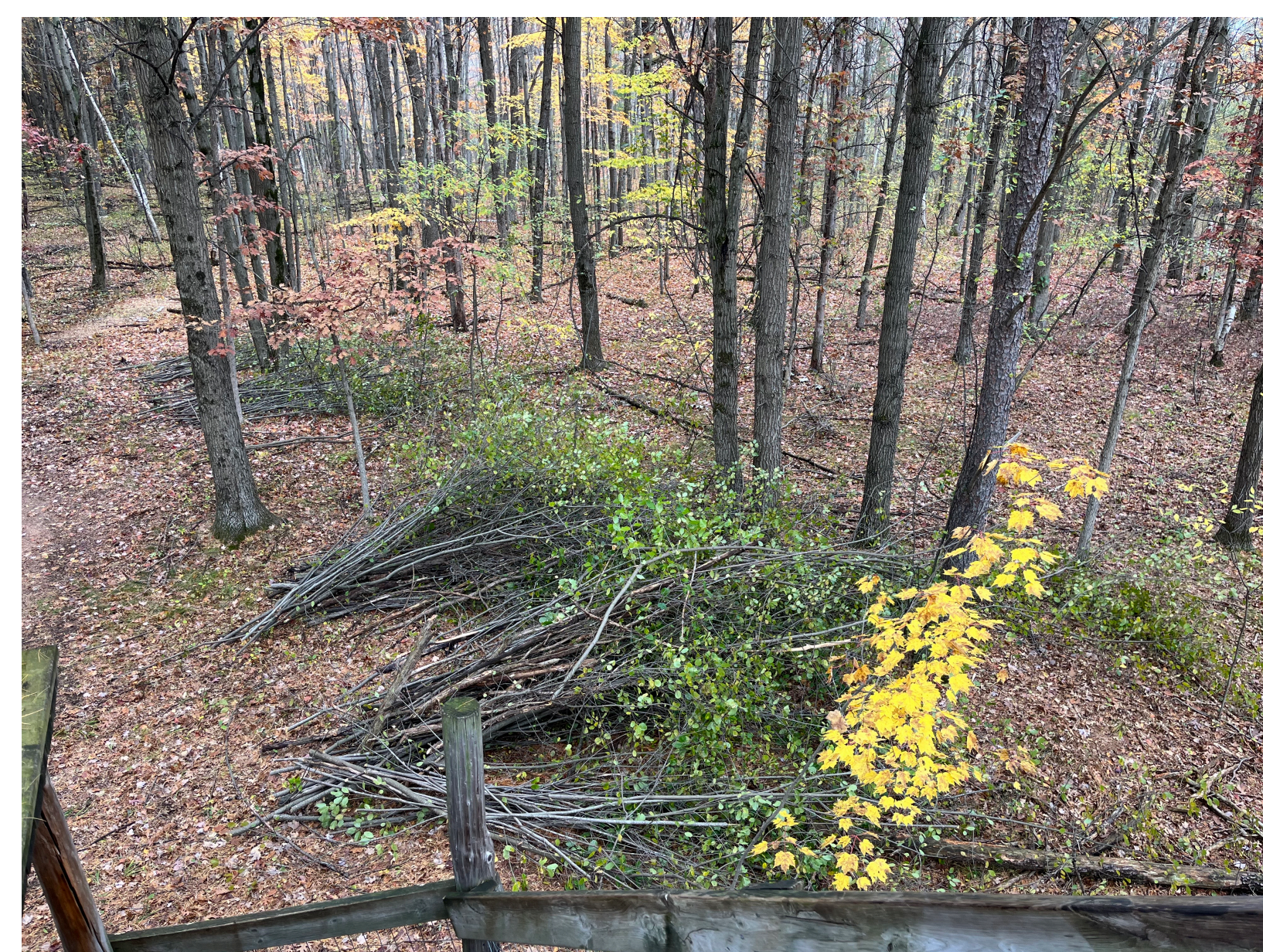
Fig 1. Buckthorn piles after the Fall 2022 Restoration Celebration in Trail of Reflections