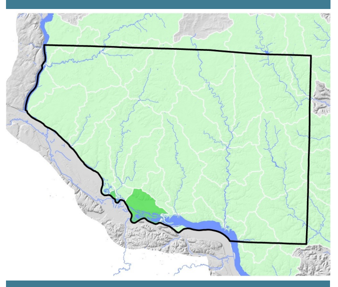
Current Wetland Cover